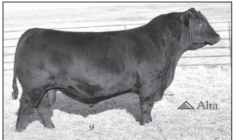
ELLINGSON THREE RIVERS 8062

Three Rivers is the breed leader for weaning and yearling growth. He sires big bodied, high performing cattle. Three Rivers has some outstanding EPDs and index rankings which include top 1% WW, YW, YH, MH, CW and $F, top 3% RADG, MW and $B, and top 4% $C. Be sure to look these calves over!