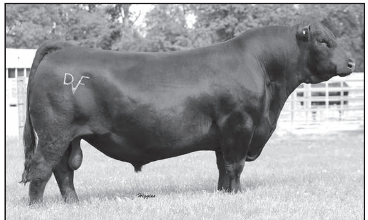
DEER VALLEY GROWTH FUND

Growth Fund is one of the sire groups we are looking forward to bringing to the sale this year. Not only does Growth Fund offer one of the most elite EPD profiles in the breed, his sons are very deep-bodied with a powerful hip and hind leg. His calves are remarkably smooth and fit into any variety of breeding programs. Growth Fund's EPDs and indexes place him in the top 1% for $W and the top 2% for YW and CW, top 3% for WW and RADG and top 4% for $F. You won't miss these calves when you see them.