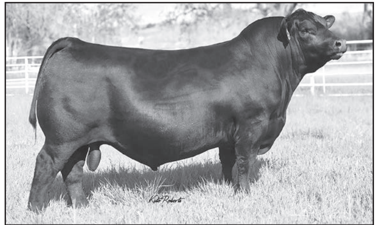
S ARCHITECT 9501

We are very excited to bring an outstanding set of Architect calves to you this year. Architect has a phenomenal maternal EPD profile paired with thick topped, deep-bodied calves. We are very impressed with how his calves have performed this year, both the males and females. Architect is in the top 1% $M, the top 2% HP and $W, the top 3% WW, and the top 10% YW, SC, docility and $C.