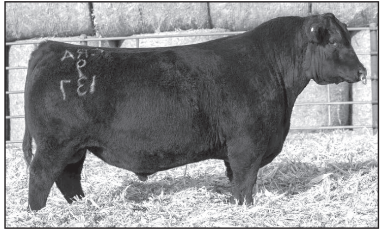
CRAWFORD GUARANTEE 9137

A high accuracy calving ease bull that transmits explosive growth and performance. Guarantee is excellent for phenotype with added frame size, body length and muscle. The perfect choice for breeders that want high performing cattle with extra eye appeal. His sons offer tremendous length and depth of rib; they are extremely eye-catching and easy fleshing. Guarantee's EPDs and indexes put him in the top 10% for $W, the top 15% for docility and the top 20% for WW and $W.