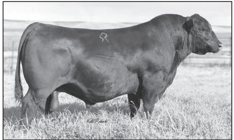
KESSLERS COMMODORE 6516

A sire that combines powerful calving ease and elite growth with added frame and muscle. Commodore is a long bodied, thick topped bull that consistently transmits a pleasing phenotype. The Commodore calves have been an excellent outcross for our breeding program and will be excellent herd sires for many. Commodore has strong maternal genetics with EPDs and indexes in the top 5% $W, top 10% WW and CEM, top 15% for YW, docility, HS, CW and $F and top 20% $M and $B.