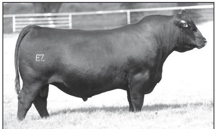
EZAR STEP UP 9178

We are excited about our first crop of Step Up calves. He offers a rare combination of traits. Step Up sires exceptional foot quality, excellent phenotype, added muscle and is potent for marbling. His first daughters are in production, and they consistently have nice udder quality with that brood cow look. Step up sons have topped sales across the country and are standouts in their contemporary groups. He provides all the components that commercial bull buyers desire. Step Up is in the top 2% CEM, the top 5% MARB, $G and $C, the top 10% SC, $M and $B and the top 15% docility and RE.