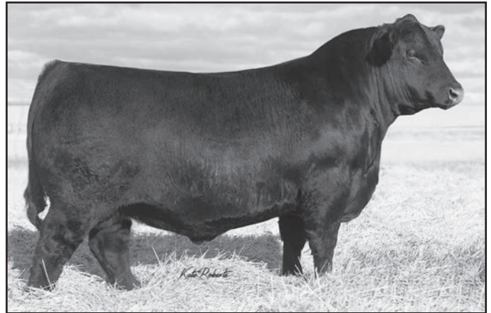
SQUARE B TRUE NORTH 8052

True North is emerging as a go-to sire for delivering strong udder quality, outstanding maternal design and reliable calving ease. His calves are big bodied, slick haired and easy fleshing with exceptional udder quality. The True North calves have performed exceptionally well on feed. He has outstanding EPDs and indexes that place him in the top 5% in docility and $W, the top 10% in $M and CED and the top 25% for WW, DMI and CEM. He is also in the top 20% for $F and heifer pregnancy.